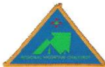
County Mountain Challenge