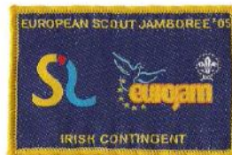
EuroJam Contingent Special Events