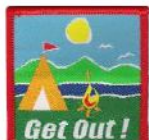
Get Out Award National Events