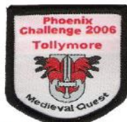
The Phoenix Challenge 2006 National Events