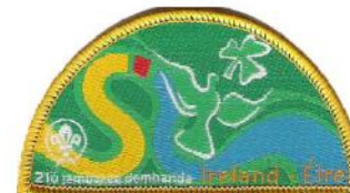
21st World Jamboree Contingent Special Events